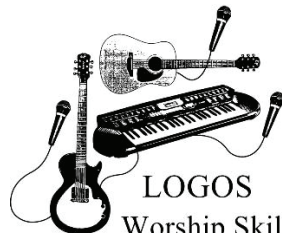
LOGOS Worship Skills